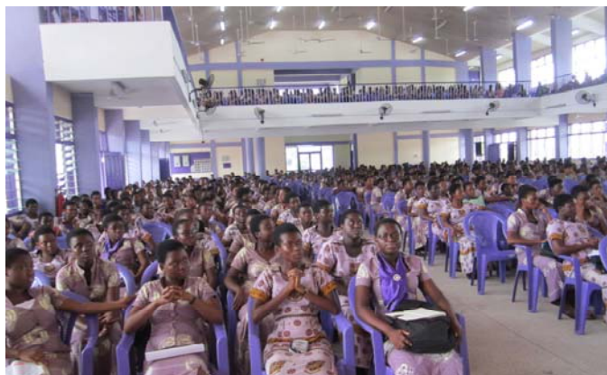
Cross-section of student participants

The importance of mentoring and networking as a tenet of MOGA became enshrined within the aims of the association at the 2006 homecoming event. A most remarkable MOGA achievement of bridging the gap between current students and the Alumni body. It is with this shared vision that on Sunday, 24 March 2013 the 1985 Year Group held their third bi-annual mentoring event. Funded and run by the '85ers, the programme had the dual goal of mentoring and networking.