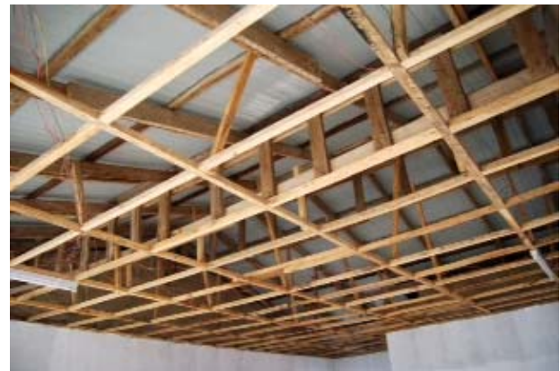
Uncompleted ceiling works at the VAS

A funding agreement signed between the "Movers and Shakers" and the MOGA Executive stipulated that the money be ring-fenced for the sole purpose of re-wiring electrical cables and placing them in PVC pipes; provision of sockets and switches; and the chemical treatment of the ceiling noggins in the VAS. The work will take an estimated six weeks to complete.