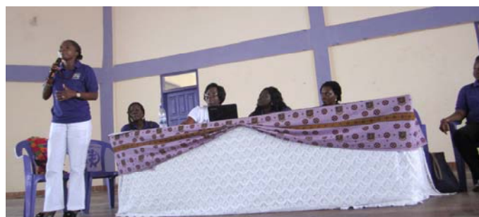
'85 Mentor addressing the students

Feedback from student attendees indicated the session was informative, enjoyable, and, above all, useful.